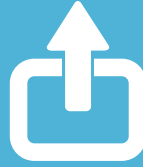
Lifts / Tower hoists