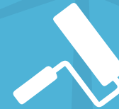
Cleaning / Painting Coating

"Skyform have been providing the full scope of our Statutory Inspection services across two of our offshore windfarm sites. They have performed the inspections in a timely manner and to a high standard, providing us with comfort that provisions out in the field are safe and secure for continued use"