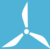
Blade access and repair