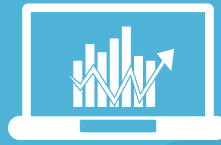
Work progress reported online