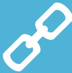
Anchor point Fall arrest systems Emergency equipment