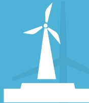
Base grouting Foundation / Water proofing